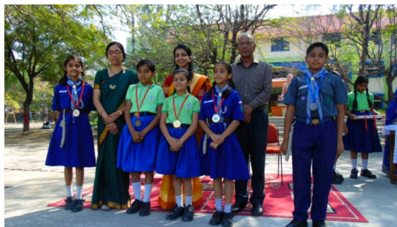
Scouts and Guide activity